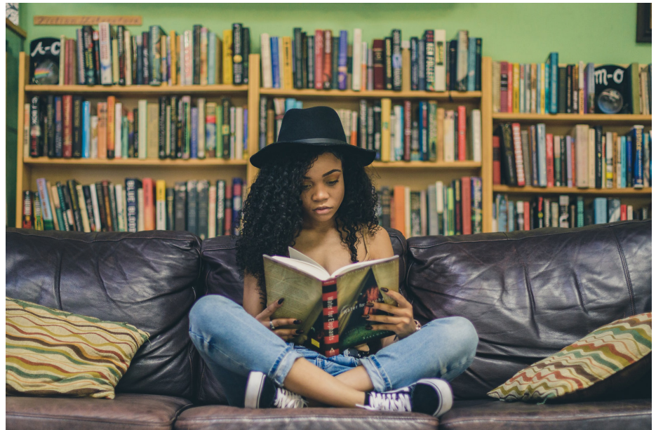
Booksmart: Scientists have shown that regular reading makes your brain work faster.

Reading helps you pay attention. "Reading is to the mind what exercise is