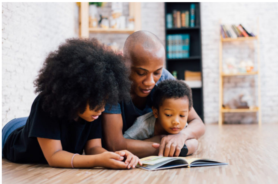
Lost for words: Reading for pleasure is a sign of success at school and in later life.

Although it is celebrated in March in the UK, the United Nations selected 23 April for the holiday because of the many authors whose birth or death occurred on this day. For example, Shakespeare, Haldor K Laxness, and Manuel Mejia Vallejo were born on 23